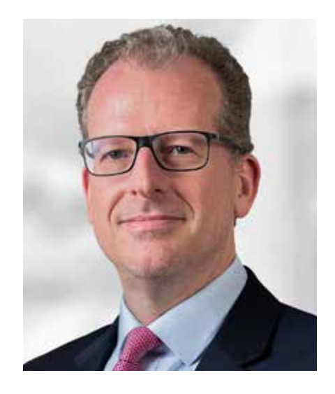
CEELM: Was it always your goal to work outside of the UK?

So I joined Allen & Overy (rather than Clifford Chance) with the ambition to work in their Moscow office one day. Fast forward a few years to 1998 when I was one week from a secondment to Moscow. I bumped into the then-managing partner in a corridor in One New Change – to be told that going to Moscow in the middle of a financial crisis in Russia was perhaps not the best idea. Plan thwarted. Soon after, however, I was offered a secondment to the Budapest office, which I duly accepted. I ended up spending six fantastic years in Budapest, married a Hungarian woman (sound familiar?), until an opportunity came up towards the end of 2004 to develop and lead the corporate practice at Clifford Chance in Prague. Almost 16 years later I am still here, managing partner of the office and leading the corporate team in CEE.